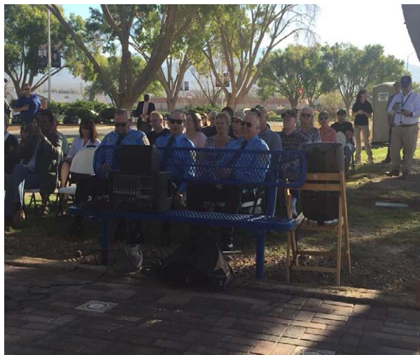
Pahrump Valley Rotary Club September 11th Memorial Ceremony.